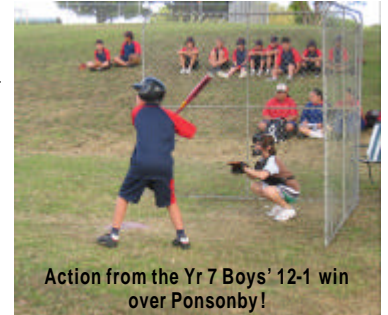
Action from the Yr 7 Boys' 12-1 win over Ponsonby!

The members of the Softball Teams would also like to thank the parents who supported them on the day.