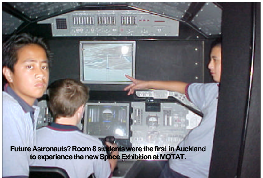
Future Astronauts? Room 8 students were the first in Auckland to experience the new Space Exhibition at MOTAT.

TICKETS AVAILABLE FROM THE SCHOOL OFFICE: PRE SCHOOLERS: FREE / SCHOOL STUDENTS $3.00 / ADULTS $5.00