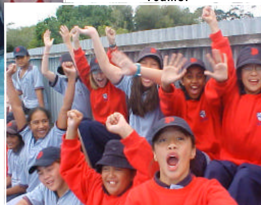
Enthusiastic Fans. Cheer on Their Class Teams!