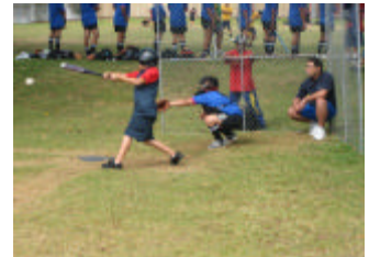
Action from the Yr 7 Boys' win over Wesley in Pool Play!