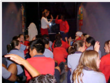
All students recently participated in two Health Programme Lessons in the Life Education Trust mobile classroom. We acknowledge the generous support of the Life Education Trust in providing this outstanding resource .