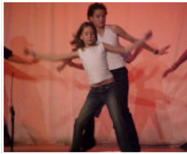
THE 2004 PERFORMING ARTS FESTIVAL