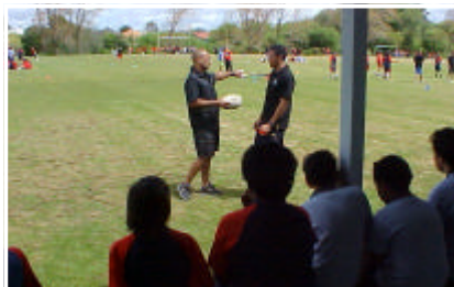
Students from Unitec ran an exciting and enjoyable Touch PE Module for our students recently.

All Board Meetings are open to the public and copies of agendas, reports and minutes are available in the School Office for public inspection. The next meeting of the Pasadena Intermediate School Board of Trustees will be on Monday 17 November at 7.30pm in the Staff Lounge.