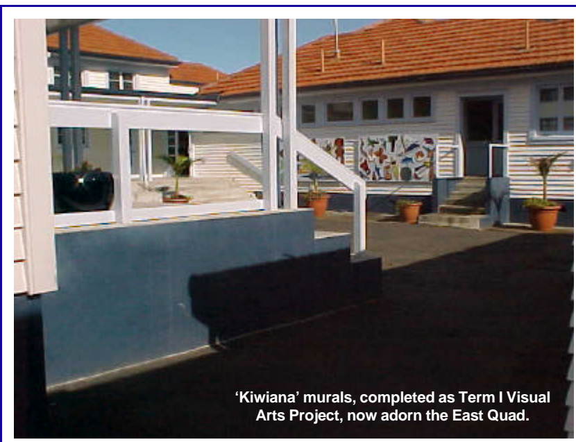
'Kiwiana' murals, completed as Term I Visual Arts Project, now adorn the East Quad.

All classrooms and corridors, the Staff Lounge, the Toilets, the Library, the Pasadena Centre, the Assembly Hall during school hours, the Secretary's Office, the Deputy Principal's Office, Meeting Rooms and Sickbay Areas, and that personnel involved in any school activities will not interact with a student while smoking.