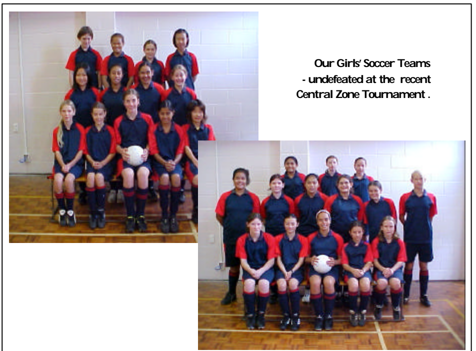
Our Girls' Soccer Teams - undefeated at the recent Central Zone Tournament .

Mufti is not compulsory, but students wearing mufti will be asked to contribute $3.00 to School Council funds.