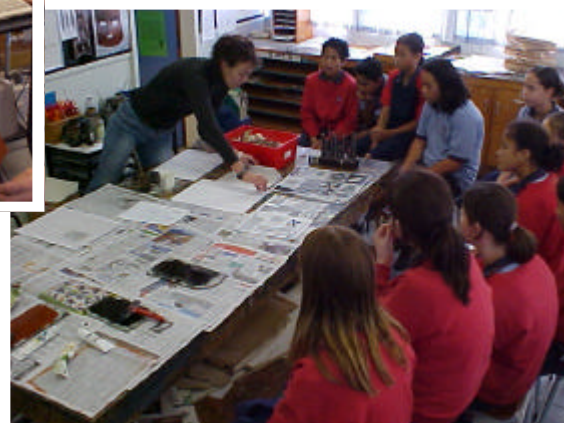
Western Springs College Activity Morning